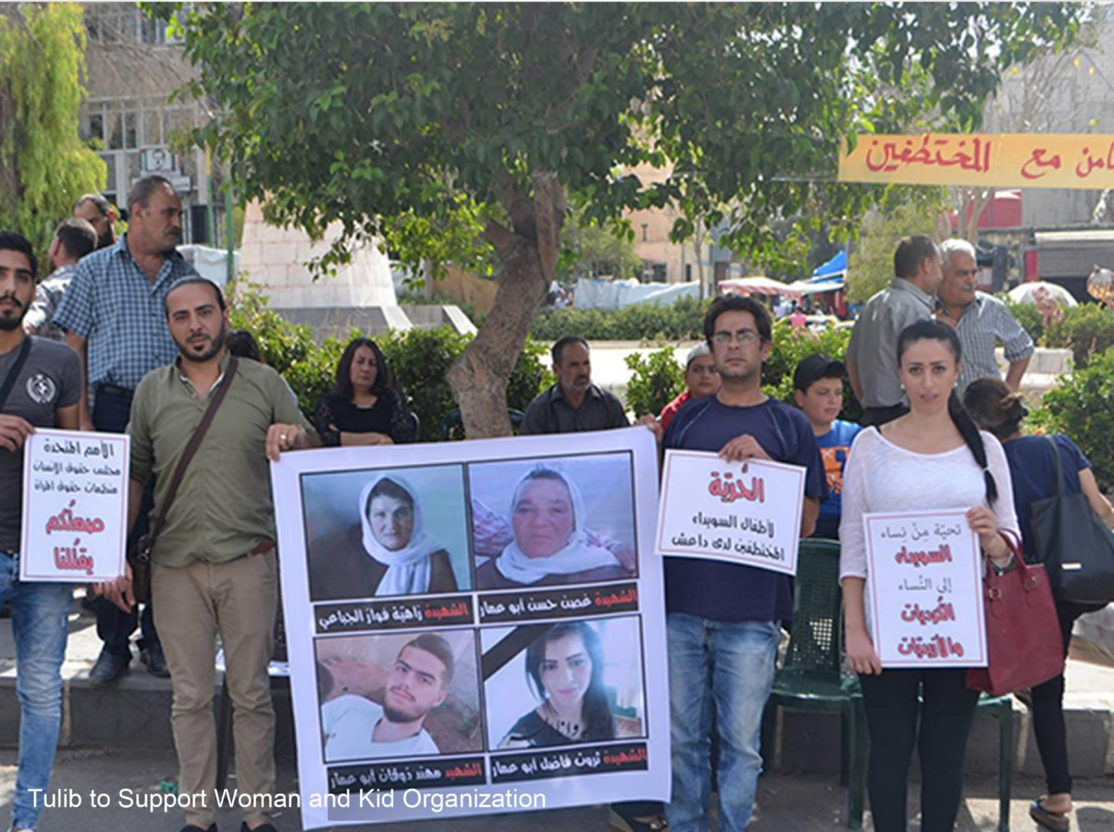
Tulib to Support Woman and Kid Organization