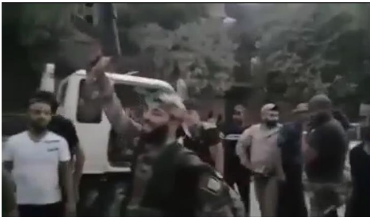
A still from a footage showing a number of young men in Yalda town after joining the 4 th Division.

Footages from Yalda, which were filmed during August 2018 and spread lately on social media, show a number of men from southern Damascus dressed in Regime forces' uniforms, carrying light weapons and cheering for the 4 th Division, which they recently joined. They were gathered at buses and cars, which would transfer them to Idlib to take part in the battle there, as a number of men appeared in those footages said.