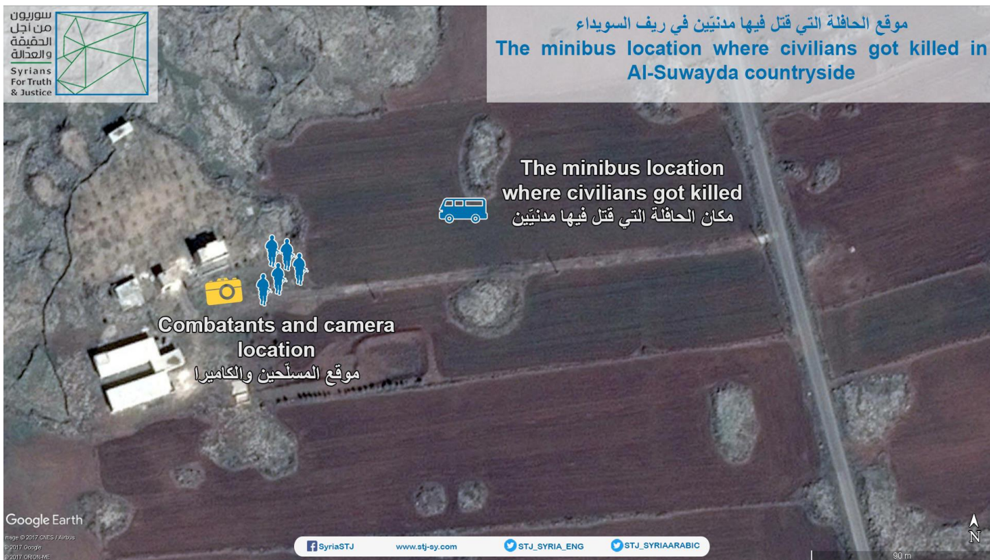
Analysis of visual evidence illustrates the location of the incident.