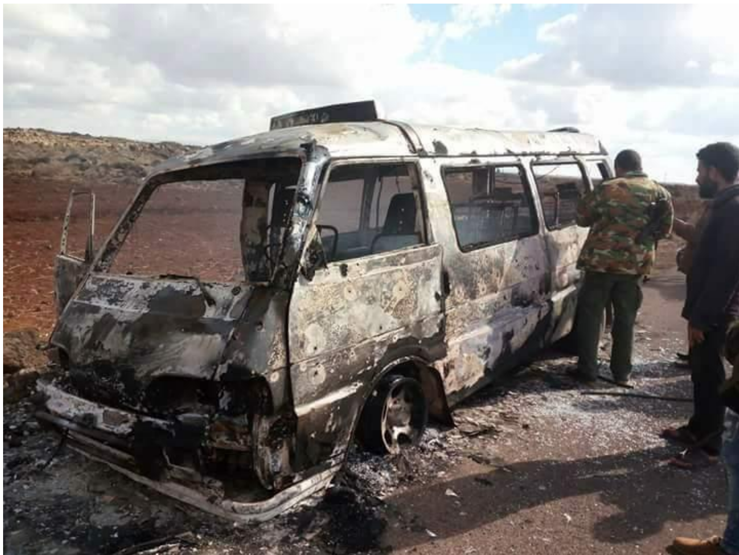
Image showing the bus that on November 23, 2017, all its passengers died; the bus was near Harran in the western countryside of Suwayda.