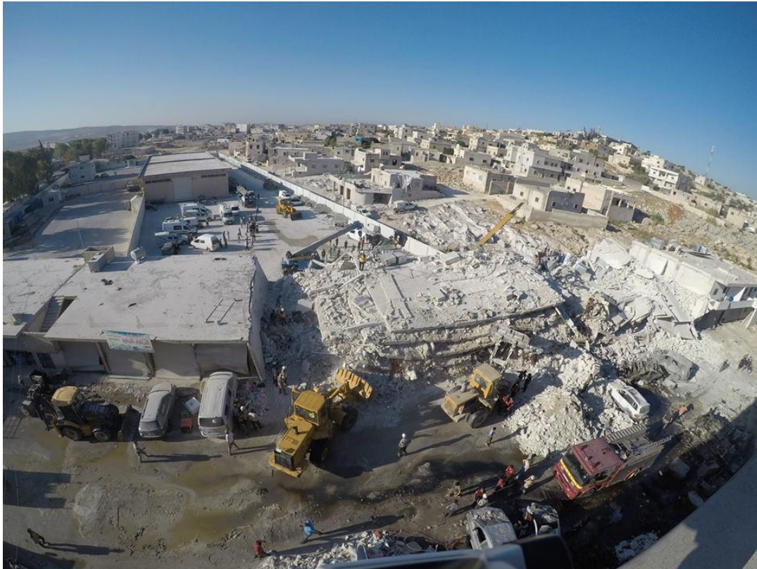
Aftermath of the ammunition depot explosion in Sarmada town.

Ghaith al-Haj, a media activist from Sarmada, told STJ that the police asked for the ID before allowing anyone to go in the blast site, and most of the witnesses he interviewed, assured that what happened was an explosion of an ammunition depot.