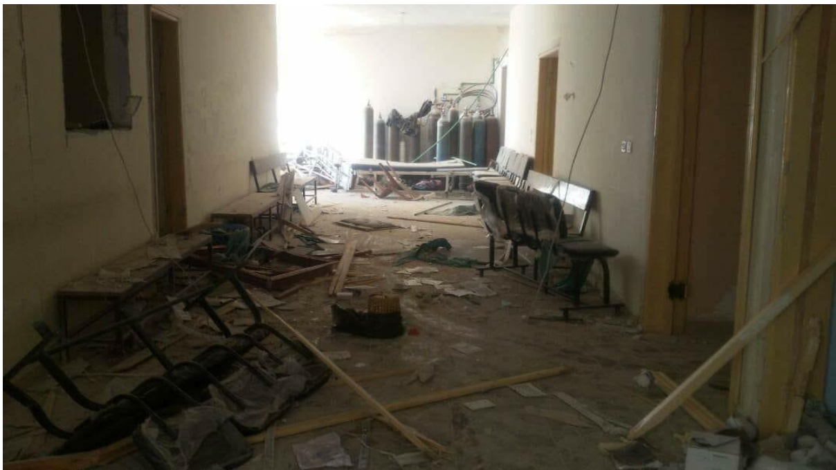
Damage caused to Nabd al-Hayat Hospital.

The Free Idlib Health Directorate of the Syrian Interim Government issued a statement, on the targeting of Nabd al-Hayat Hospital, in which it declared it out of service due to severe damage of its equipment.