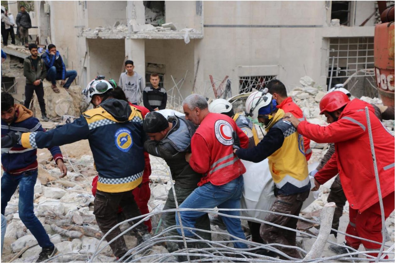
Image shows the attempts of the civil defense teams to retrieve the victims of a massive explosion, which took place in Idlib on April 9, 2018.