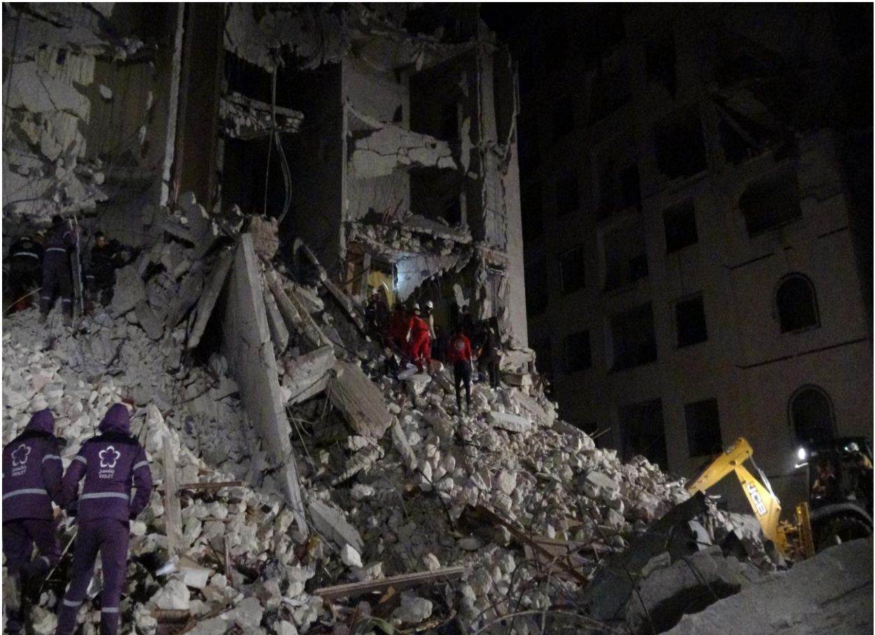
Image shows a side of the devastation caused to al-Naseem neighborhood by the massive explosion of April 9, 2018.

"Abu Muhammad", the supervisor of a military aviation observatory in Idlib, gave another testimony to STJ where he said that the observers sent a circular to people of Idlib, in order to be wary of a long-range rocket launched from Russian battleships in the Mediterranean, at 5:55 p.m. on April 9, 2018, just a few minutes before the explosion, he continued: