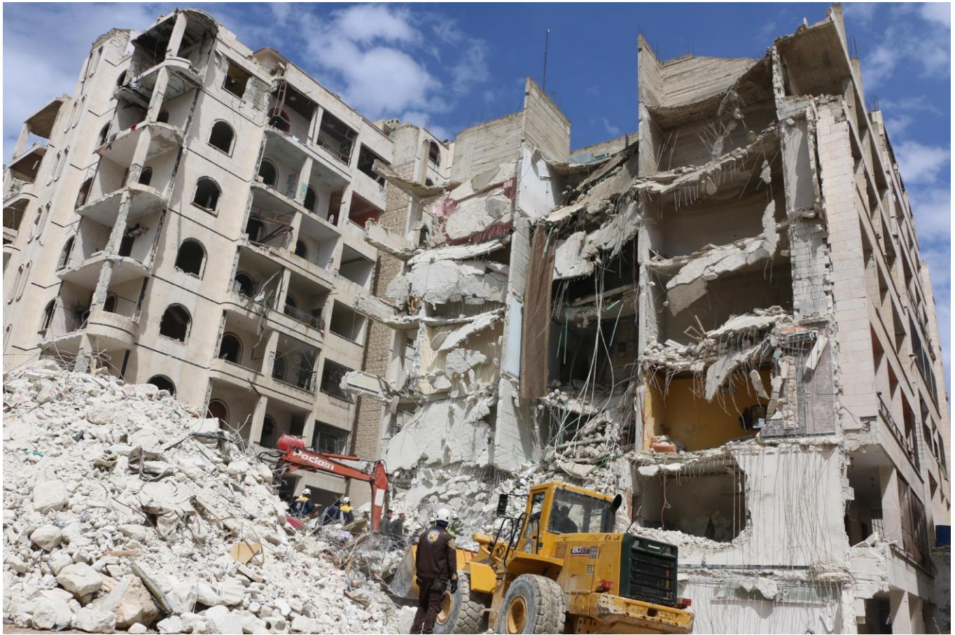
Image shows a side of the devastation in Idlib city, following a massive explosion on April 9, 2018.