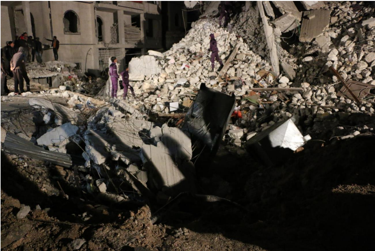
Image shows an aspect of the devastation in the al-Naseem neighborhood in Idlib, following a huge explosion there on April 9, 2018.

"Muhammad al-Hussein", an expert in remnants of war field from Idlib province, said to STJ that the explosion that shook Idlib on April 9, 2018, was likely caused by a long-range rocket, and in this regard he goes on to say: