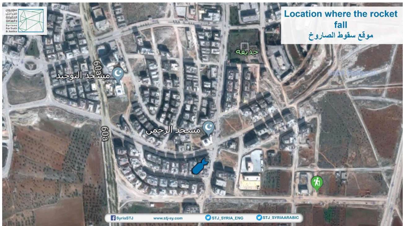
A satellite image shows the explosion site

Most of the buildings at the site of the explosion were significantly destroyed. The death of 29 people and the injury of more than 150 others was documented. We didn't find the cause of the explosion, but by looking at the massive damage it left, we suggest the cause to be a highly explosive missile fired from the Russian battleships, especially since I searched and saw no traces or residue of a car bomb, according to eyewitnesses from the city, the residents heard a clear voice of a rocket just before the explosion occurred."