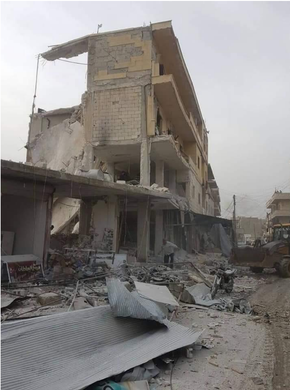
Image shows a residential building, adjacent to the popular market in the city of Harem, on which a rocket landed.