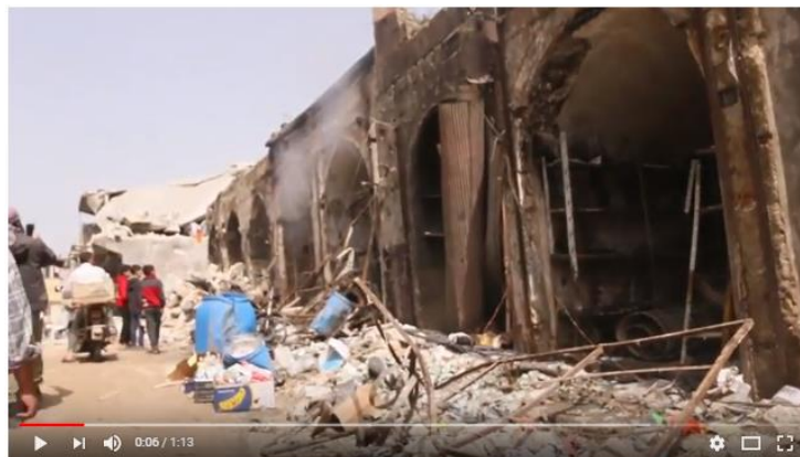
الحصيلة النهائية لمجزرة حارم 23-3-2018 الدفاع المدني السوري ادلب

A footage published by the Civil Defense in Idlib province showed a side of the devastation in the popular market and surrounding residential neighbourhoods in Harem city, following the aerial bombardment of March 22, 2018. The video, filmed on the day after the incident (March 23, 2018), shows a member of the civil defence talking about two raids by military aircraft at 4 p.m. on March 22, 2018, targeted the popular market in the city and the adjacent residential neighbourhoods.