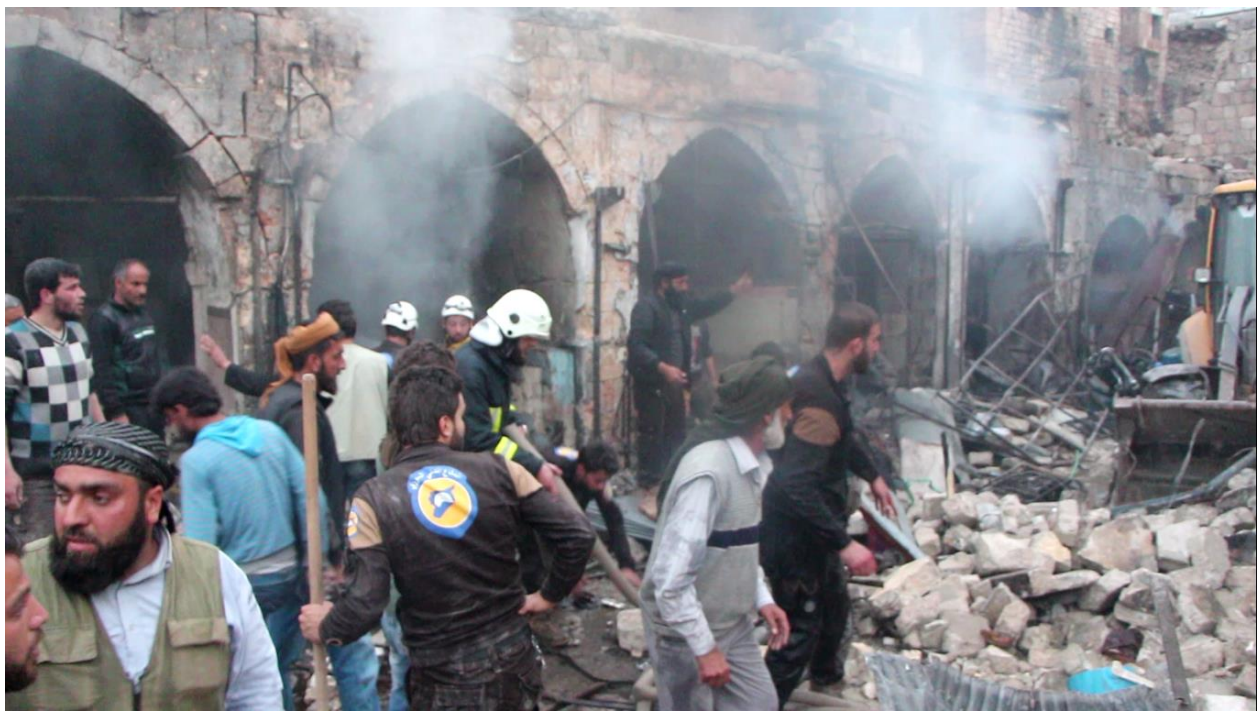
Image shows a side of the devastation caused to the popular market and adjacent residential buildings in the city of Harem, by an aerial bombardment on March 22, 2018.