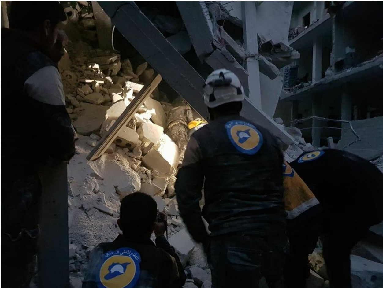
Image shows the attempts of the civil defense to lift the wounded and the dead from under the rubble, following the aerial bombardment on a popular market and surrounding residential buildings in Harem on March 22, 2018.