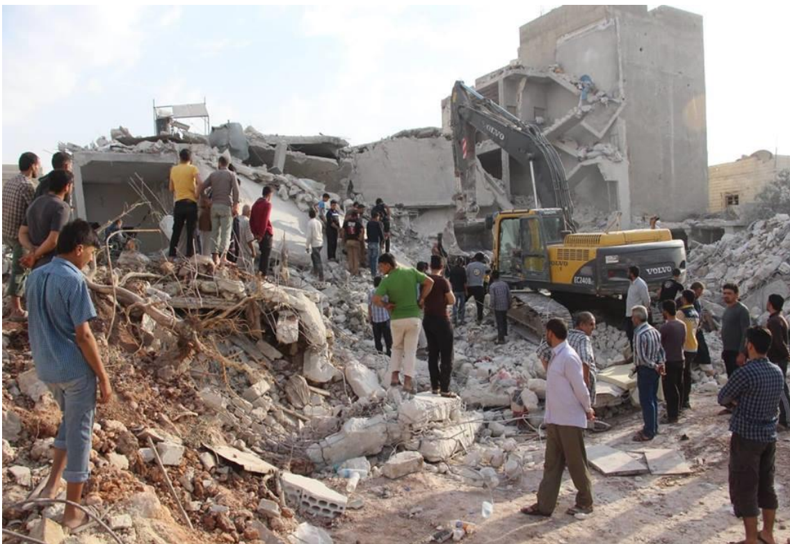
An image of some of the aftermath of an airstrike inflicted to Zardana town, Idlib countryside on June 8, 2018.

displaced persons who came from most of the Syrian provinces. The targeted neighborhood was a safe place for the locals and it consisted of several buildings adjacent to a mosque. The bombardment coincided with the people going to perform prayers in the mosque but the Russian warplanes targeted the area with two double airstrikes. There was no sign of any military targets within the town completely. Up to 50 persons have been killed, including women and children, as well as scores of injuries."