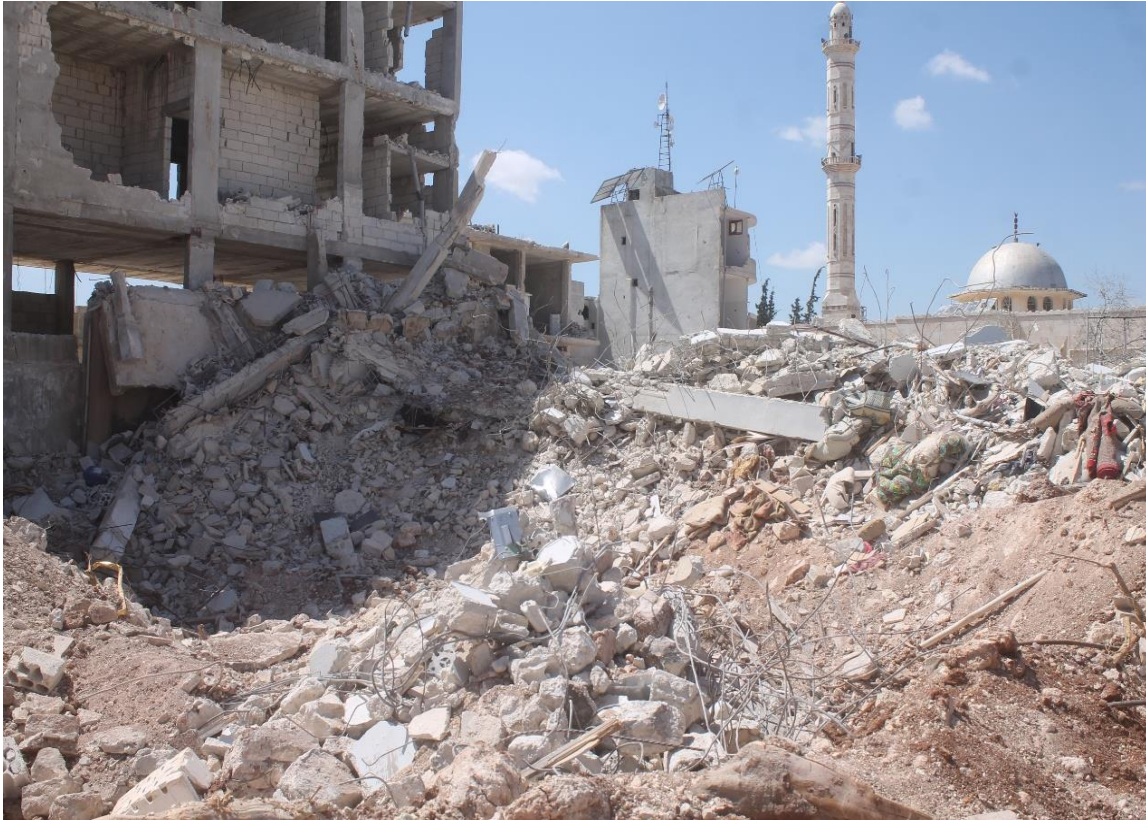
An image shows the strike location of a vacuum rocket in Zardana town, Idlib countryside on June 8, 2018.