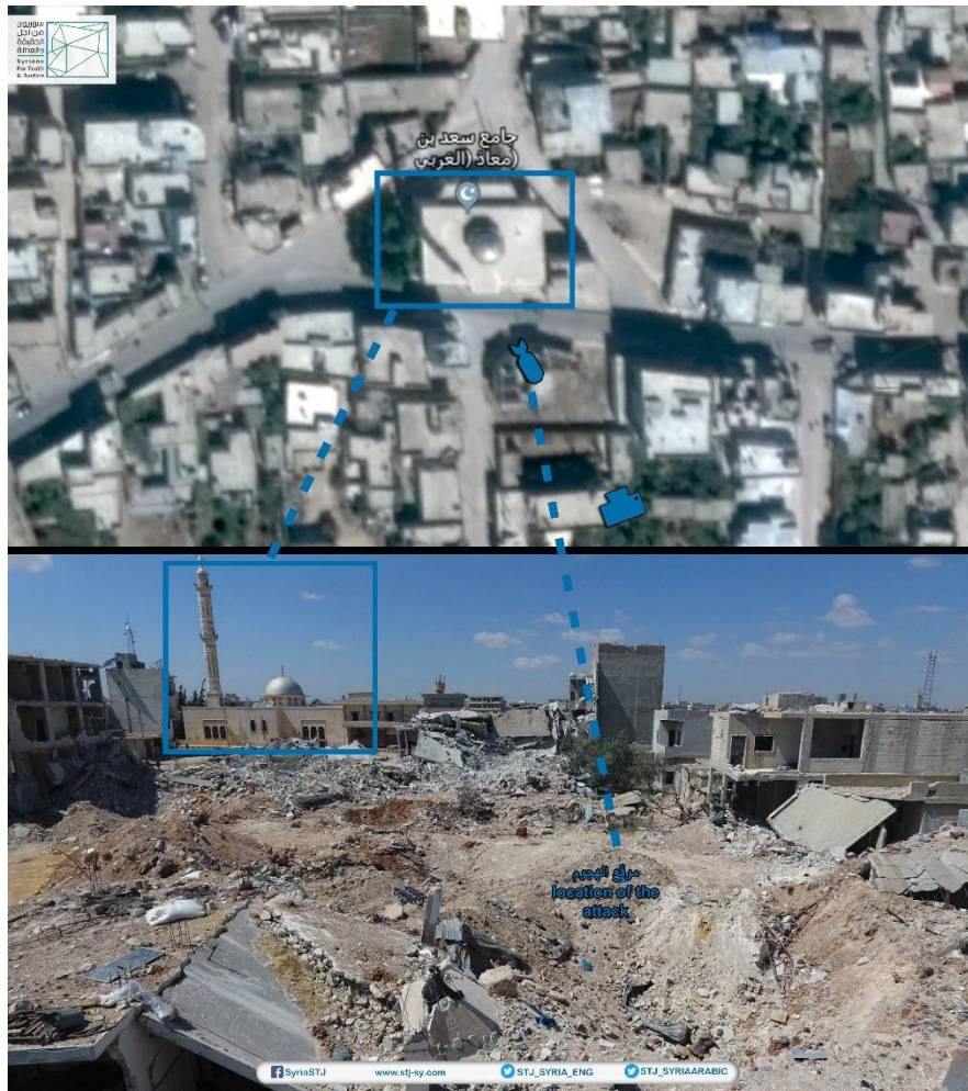
Analysis of a visual evidence.