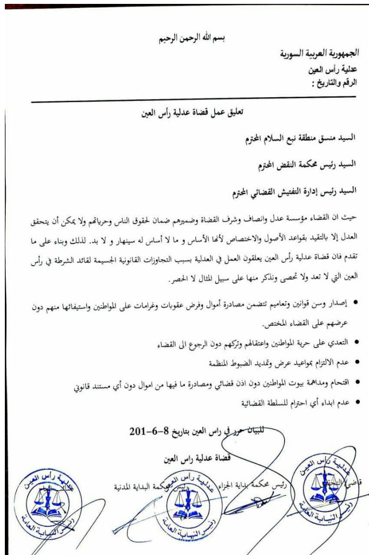
Image 7 - The statement issued by the Judges in Ras al-Ayn/Serê Kaniyê.